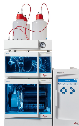
Figure 2: The ALEXYS analyzer for Kanamycin & Amikacin, consisting of the ALEXYS Antibiotics base system - Isocratic, and dedicated flow cell and bottles. The base system consists of a P6.1L pump with, an AS6.1L autosampler, an ET 210 Eluent tray and the DECADE Elite electrochemical detector.

**) The USP monographs related to kanamycin and amikacin [6 - 11] actually prescribe a slightly stronger mobile phase concentration of 115 mM NaOH